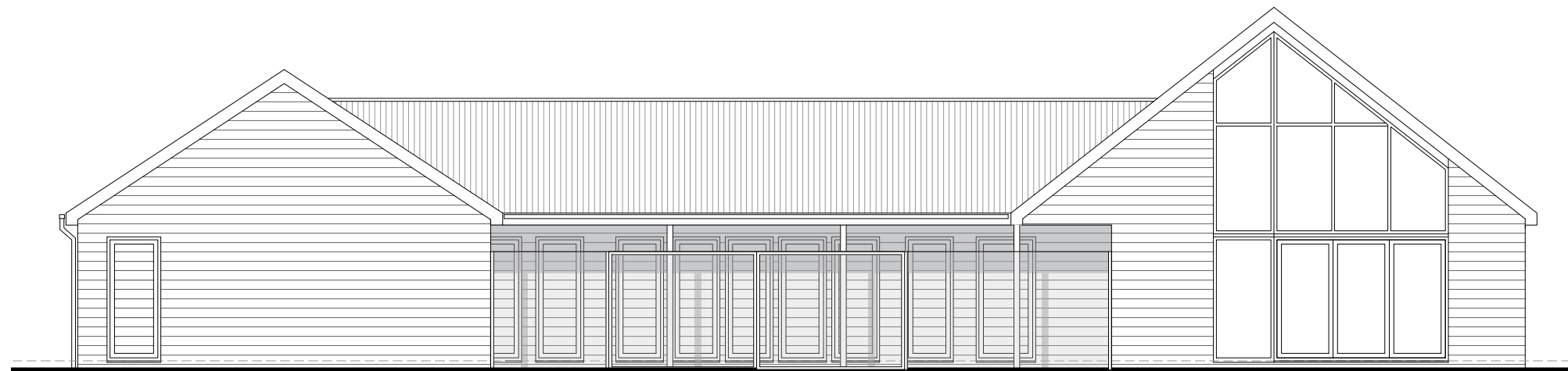
East Facing Elevation